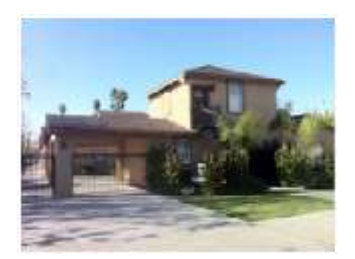
HEMET (CLICK FOR INFO)