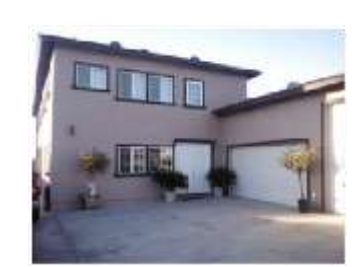
MORENO VALLEY (CLICK FOR INFO)