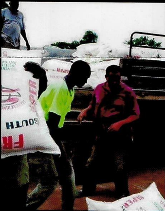
WE STARTED THE FEEDING PROGRAM TO KEEP PEOPLE FROM STARVATION AND SICKNESS