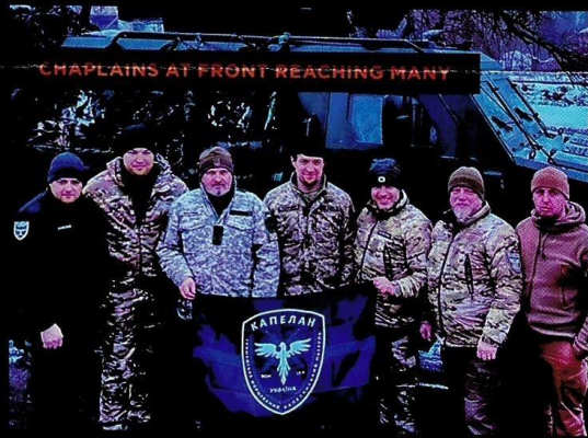
CHAPLAINS AT FRONT REACHING MANY

Hopefully, in time, we will have the ability to facilitate adoptions. It would be my heart's desire that the homes would be a place of love until we can find a family that will care for these children.