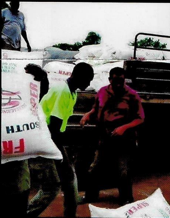
WE STARTED THE FEEDING PROGRAM TO KEEP PEOPLE FROM STARVATION AND SICKNESS