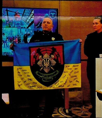
FLAGS SIGNED BY CHAPLAINS GIVEN TO ALL MEMBERS OF OUR TEAM IN APPRECIATION FOR SUPPORTING UKRAINIAN CHAPLAINS

I have always thought that if I reached an age when I was too old to travel, I would enjoy restoring a classic car. I enjoy watching shows that take an old car that is a wreck and bring it back to life. Truthfully, I would enjoy having a garage with half a dozen cars that I could slowly restore. Watching shows that bring a wreck back to a thing of beauty reminds me of how the Lord takes broken lives and restores them. But I would far more desire to save these children and set up places of refuge for the handicapped and children of all ages, including babies and toddlers. Please understand we plan on starting what does not exist in Ukraine, and when we find children who are being abused by parents, we will not allow it to continue. When the laws of the land do not protect women and children, we, as believers, answer to a higher law, God's law, and will do what is necessary to ensure these children are not harmed by parents or anyone, such as a boyfriend.