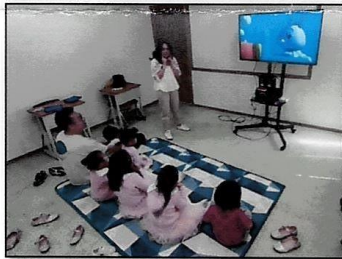
Our Little Sunday School Class

We've got some pictures to share with you. That doesn't happen too often.