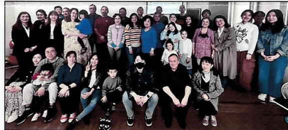
Had Some Visitors from Harvest World Mission

Also we sent some money back in December to help rebuild a small church in the Philippines that had been damaged from the weather. We look forward to seeing it when everything is complete.