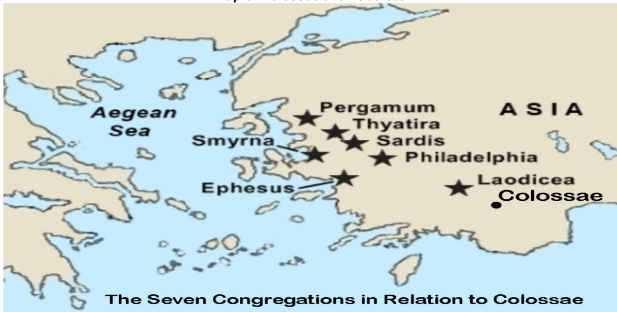
Map of Colossae and Laodicea

In the last time, in Colossians 1:28-29, " Him we preach , warning every man and teaching every man in all wisdom , that we may present every man perfect in Christ Jesus . 29 To this end I also labor , striving according to His working which works in me mightily ," you may live on to the perfection of Jesus Christ, as Paul and Timothy warn and teach, from the principles of Christ's doctrine including the gospel which Paul and Timothy preach. Until meeting Jesus of glory in heaven with exceeding joy, at either rapture or death, we are not perfect just as Jesus Christ but are toward the perfectness of Jesus Christ. And so now we can be more like the perfect Jesus Christ toward the perfectness at the time of your glorification. So, to present every man perfect in Christ Jesus, Paul works much and strongly according to the power of Christ who lives in Paul – the Spirit of God or the Spirit of Christ or the Helper lives in every Christian.