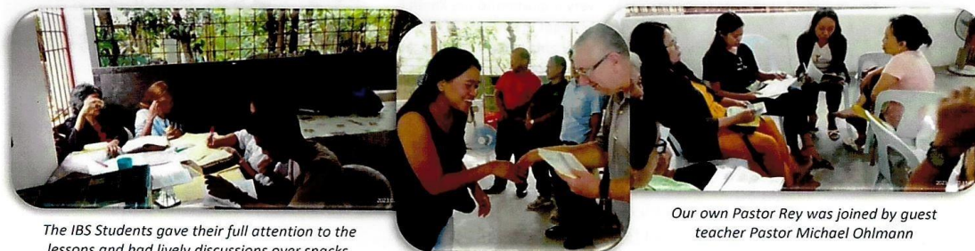
The IBS Students gave their full attention to the lessons and had lively discussions over snacks.

PHILIPPINES: SEMINAR BRINGS UNDERSTANDING TO THE BIBLE Without Bible School, Pastors and Church Workers can't learn how to better understand the Bible. In the States, we often take for granted our ease to access via the Internet and Bible study books, which is not the case in most of Asia. Our training in Inductive Method of Bible Study permanently changes one's life, giving them a tool that can be used repeatedly to better teach the Word of God.