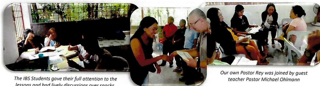
The IBS Students gave their full attention to the lessons and had lively discussions over snacks.

PHILIPPINES: SEMINAR BRINGS UNDERSTANDING TO THE BIBLE Without Bible School, Pastors and Church Workers can't learn how to better understand the Bible. In the States, we often take for granted our ease to access via the Internet and Bible study books, which is not the case in most of Asia. Our training in Inductive Method of Bible Study permanently changes one's life, giving them a tool that can be used repeatedly to better teach the Word of God.